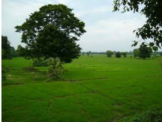
Paddy fields with greenish environment