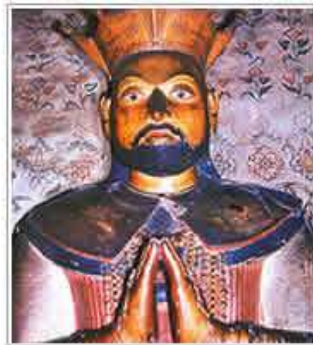
The king Kashyapa's character will look like this

Since the game is based on 3 rd century BC in Sri Lanka, the game will have an ancient look. There were no any motor vehicles at that time. The Elephant was the main transportation method of Sri Lanka at that time. Therefore game will have elephants as the transportation method. The king will look more elegant than other civilians or army from his appearance, dress and jewelry.